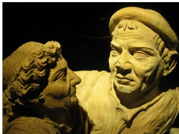
Etruscan couple on a sarcophagus in the museum in Volterra

Day 8 – Tuesday, April 26: Departure after breakfast. We enjoy wonderful Tuscan landscapes en route to Volterra , yet another hilltop town with Etruscan antecedents. Volterra overlooks a green valley on one side and the “Balze,” a strange mass of highly eroded hills, on the other. The local attractions include the Etruscan city gate, the attractive Piazza dei Priori, the Via dei Sarti lined with medieval palaces, and the excellent local Etruscan Museum. In the afternoon we enter the Maremma, a region in southern Tuscany in which the Etruscans felt very much at home, stretching between the Appenine Mountains and the part of the Mediterranean known to the Greeks as the Tyrrhenian Sea, meaning Sea of the Etruscans, since the latter were known to the Greeks as Tyrrhenoi , Tyrrhenians. Accommodation in a four-star Tuscan country-style hotel near the town of Grosseto, the Antico Casale di Scansano .