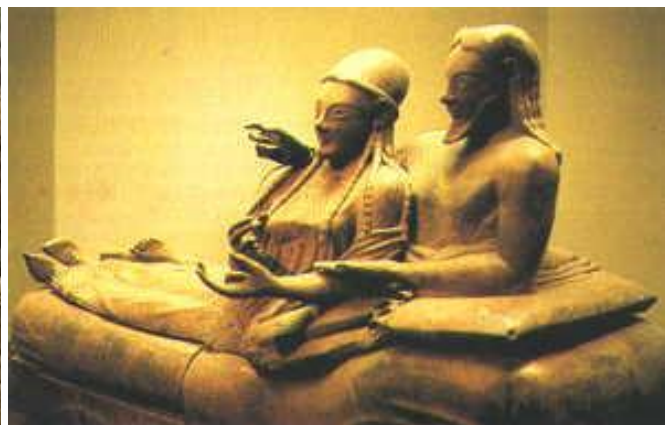
The Bride and Groom in Rome’s Villa Giulia Museum