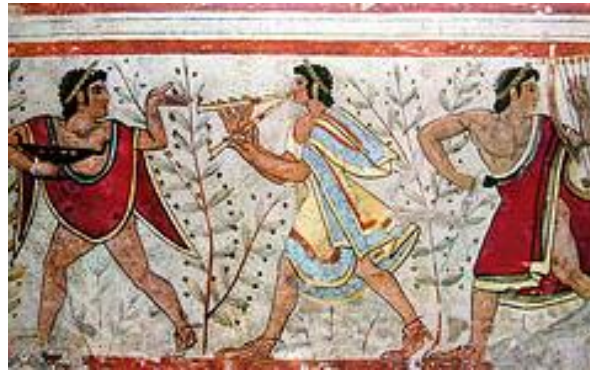
Etruscan frescoes in a tomb in Tarquinia

Pauwels Travel Bureau Ltd. 15 Egerton Street, Brantford, Ontario N3T 4L4, Canada Tel: 519-756-4900 / 519-753-2695 - Fax: 519-753-6376 Email: tours@pauwelstravel.com – Website: pauwelstravel.com