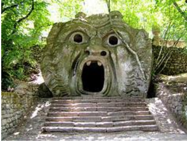
One of the “monsters” in the park of Bomarzo!

Day 2 – Wednesday, April 20: Morning sightseeing tour of Perugia, a city whose ancient churches, palaces, and piazzas radiate a wonderful medieval atmosphere. The highlights will include the Piazza IV Novembre, one of the most attractive squares in Italy, but we will of course focus on the imposing Etruscan monuments, such as the monumental city gate, an intriguing cistern , and the underground tomb of a noble Etruscan family, known as the