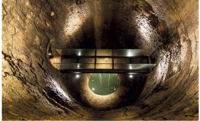
Perugia’s Etruscan cistern with its visitors’ walkway

Volumni Hypogaeum. Afternoon visit to the local archaeological museum with its impressive collection of Etruscan objects, followed by free time for shopping and/or individual exploring.